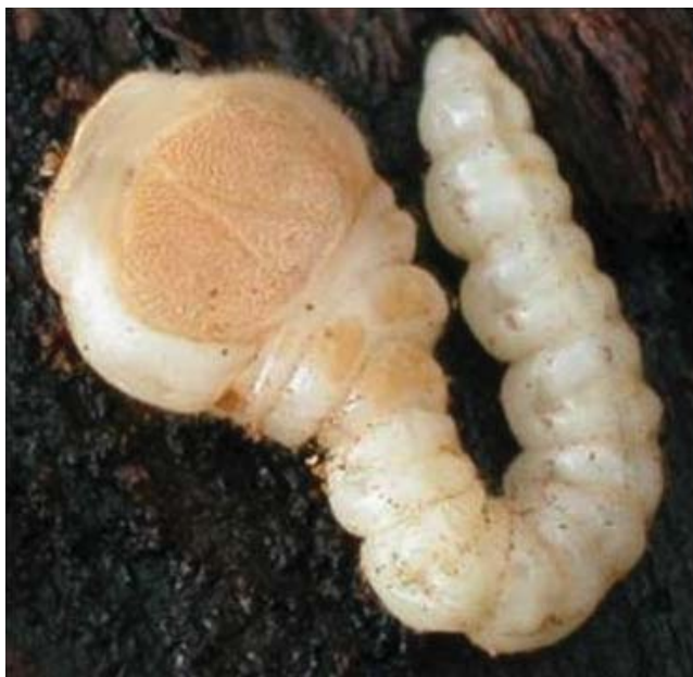
Fig 1. Buprestid larvae are commonly called flatheaded borers because the first thorax segment (prothorax) is enlarged behind the reduced head, which gives the appearance of a 'flattened' head.

The metallic wood-boring beetles (Coleoptera: Buprestidae) can be significant pests of woody plants. There are approximately 750 species of buprestids in North America (16). Buprestid larvae are commonly called flatheaded borers because the first segment of the thorax is enlarged behind the reduced head, which gives the appearance of a 'flattened' head (Fig. 1). Buprestid species attack living or dead host materials, as well as small to large trees, branches, main trunks, roots, or mine leaves; and a few species are problematic on dry seasoned timber (5). In nursery and landscape settings, the flatheaded appletree borer [ Chrysobothris femo-