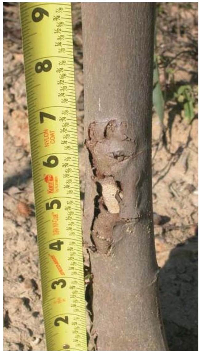
Fig 2. Damage from FAB larval tunneling beneath the bark typically begins as a sunken dark area on the trunk and may eventually split to reveal 'caked' frass beneath the bark.

rata (Olivier)], the Pacific flatheaded borer ( Chrysobothris mali Horn), the two-lined chestnut borer [ Agrilus bilineatus (Weber)], the bronze birch borer ( Agrilus anxius Gory), and the emerald ash borer ( Agrilus planipennis Fairmaire) are problem species that attack living trees.